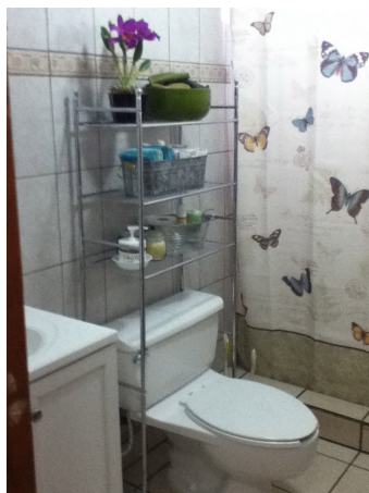
Bathroom plumbing and sanitation issues resolved! And it's beautiful as well!!

The monumental task of getting household goods from San Diego to Ensenada was finally accomplished the first week in October! We now have 2 twin beds and 2 twin XL beds for the girls, as well as living room furniture, dining table and chairs, patio table, BBQ (hooray!), desks and chairs, and all basic kitchen goods! The next goal is to finish all the unpacking!!