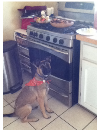
Waiting hopefully (sorry girl!)