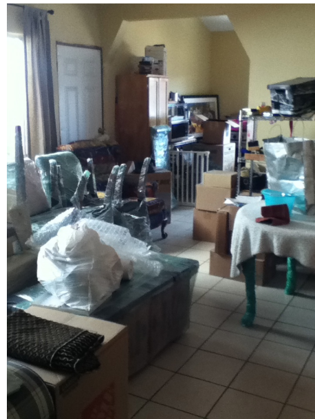
Shortly after furniture finally arrived!

The monumental task of getting household goods from San Diego to Ensenada was finally accomplished the first week in October! We now have 2 twin beds and 2 twin XL beds for the girls, as well as living room furniture, dining table and chairs, patio table, BBQ (hooray!), desks and chairs, and all basic kitchen goods! The next goal is to finish all the unpacking!!