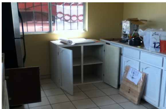
Kitchen partway through renovation

Extensive work has been done to transform and equip a three bedroom house in Ensenada into the residence for Casa de las Mariposas! The work has included plumbing repairs, installation of lights and ceiling fans, security doors, kitchen and bathroom counters and shelving, and building an enclosed laundry room and storage area. We have also purchased a stove, refrigerator, and washer/dryer.